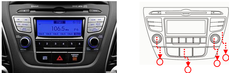
Fig11. Priority of applied texture on car console