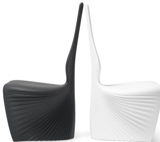
Fig2. Designed by RosLovegrove, use of texture intensifies the form [source: www.designboom.com]