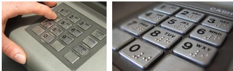
Fig1. Texture applied to ATM for blind person

• Another reason in choosing texture patterns for a product is given personality to it. Deciding on a texture pattern for a product can be carried out in a way that attributes the product to a particular group of people or reminds a specific lifestyle (Figure 2-4).