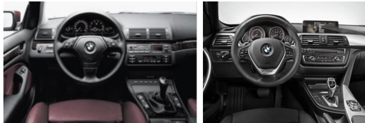
Fig8. The 2000 BMW 325i interior (left) and 2013 BMW 325i interior (right)

Shou yuan (2014) certified that most car manufacturers are making great efforts in designing and promoting In-Vehicle Information System (IVIS), which combines traditional car functions with internet radio, social-networking communication and other forms of internet connection. One of the most compelling illustrations of IVIS is the big screen based navigation system. If you compare two same model cars (BMW 325i) from 2000 and 2013 (Figure 8), you will clearly notice that the biggest difference between the interior of these two cars is an 8-inch LCD display screen - not only for basic GPS-based map navigation, but also to easily access and display driving information (e.g., real-time traffic conditions, weather conditions, and place of interesting).