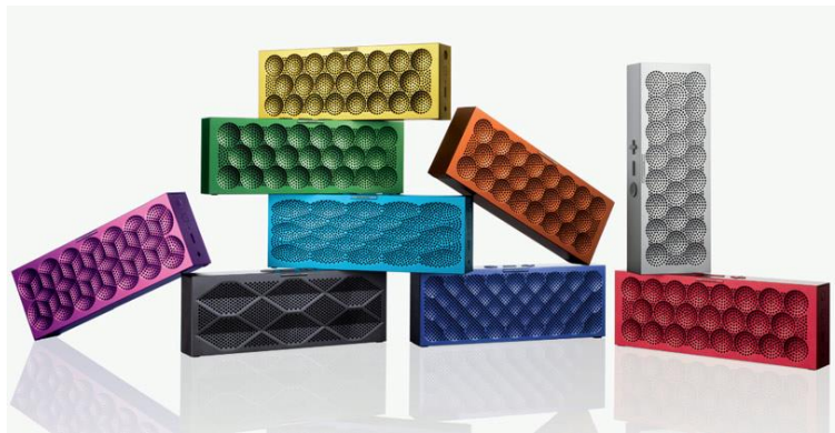
Fig4. In these speakers, texture is applied for functional reasons