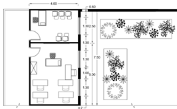
Fig. 3. Plan of the two classes with different areas (Reference: authors)

Two different-size classrooms (Fig. 3) were used. Classroom A had an area of 10 m 2 , but Classroom B was 20 m 2 in area. Both classrooms had a view to a natural landscape.