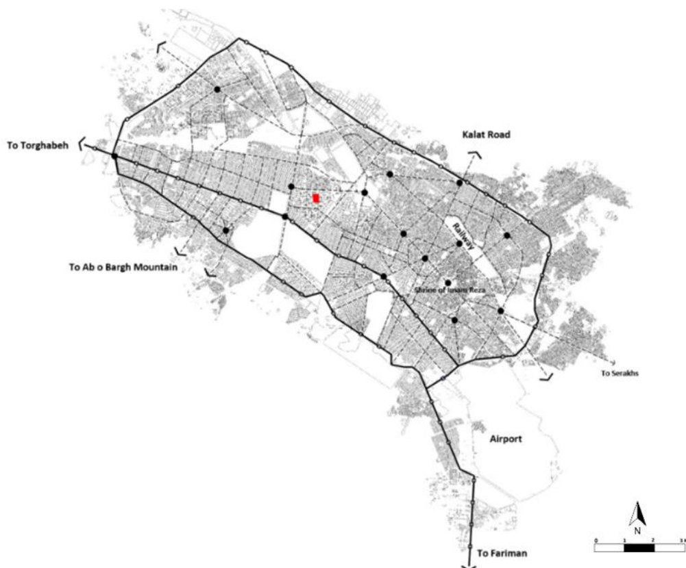
Fig. 3. Mashhad and study area

The study population is relatively homogenous in education and income level (Table 2). Based on the July 12, 2011 Census Data of Iran Statistical Center, residents in the study area, in comparison to the other zones, are of high-income class and highly educated [60]. The descriptive statistics of residents' job status is provided in Table 3.