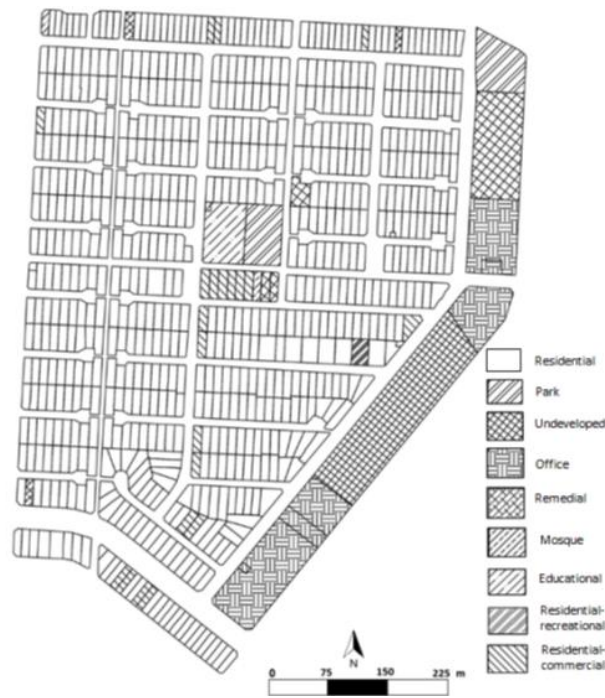
Fig. 3. The study area land uses