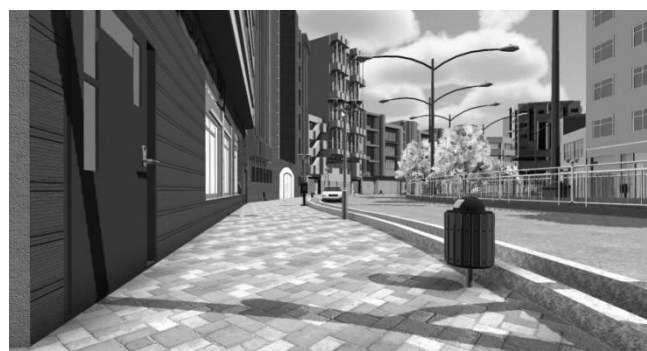
Fig. 2 Creating realistic virtual environments through visualization measures

more realistic. If in urban simulations, for example, displayed virtual environments do not look dynamic and vibrant through the movement of their elements (such as cars), they will not be able to convey the feeling and experience of a realistic urban space to observers. In this regard, measures such as adding human personage (characters) with expected movements in urban spaces, simulating natural movements of cars on roads being tested and providing natural movement for elements and details in the environment (such as flags, trees and grass in the median strip) help the urban space looks more natural. In fact, these events can enrich the individuals' perception of the virtual environment and contribute to generalizability and reasonability of results [11].