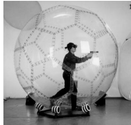
Fig. 4 Using a Virtusphere can create high levels of immersion in virtual environment. Source: [17]

Indeed this tool can simulate the participant physical movements in different directions and with various rhythms (such as walking, running, jumping, etc.). On the other hand, because of its sphere form, the user can navigate along an indefinite length. Hence according to these features, virtusphere can be used in urban design researches for analyzing and investigating users behavior, perception and movement desires in urban spaces.