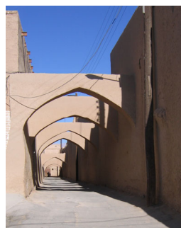
Fig. 1. Platforms (Pīrneshīn) at the entrance of buildings and routes in desert villages.

refer to examples of textures of Iranian cities. These examples are set out to demonstrate the inclusion of urban spaces from different aspects. They are about the desert villages, Abyaneh, and Masouleh.