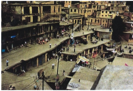
Fig. 3. Routes on the roofs of houses, Masouleh

In side surfaces of many routes that were built for providing access to residential spaces, some platforms were made so people could regain their power when tired. This phenomenon promoted social activities in addition to the communicational activities as the most important functions of urban spaces. Face to face communication of the people that used to exchange information and thoughts when visiting was the social activity in routes and alleys that could form a part of people's leisure time.