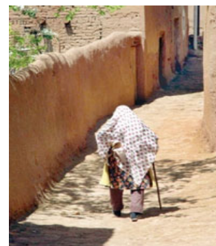
Fig. 2. Routes in Abyaneh

In entrances of traditional buildings, there are some platforms called Pīrneshīn which is a communal space for neighbors to gather and speak to each other. Furthermore, Pīrneshīn is a place to be used as a sitting and resting space for elderly persons and people tired due to carrying heavy loads.