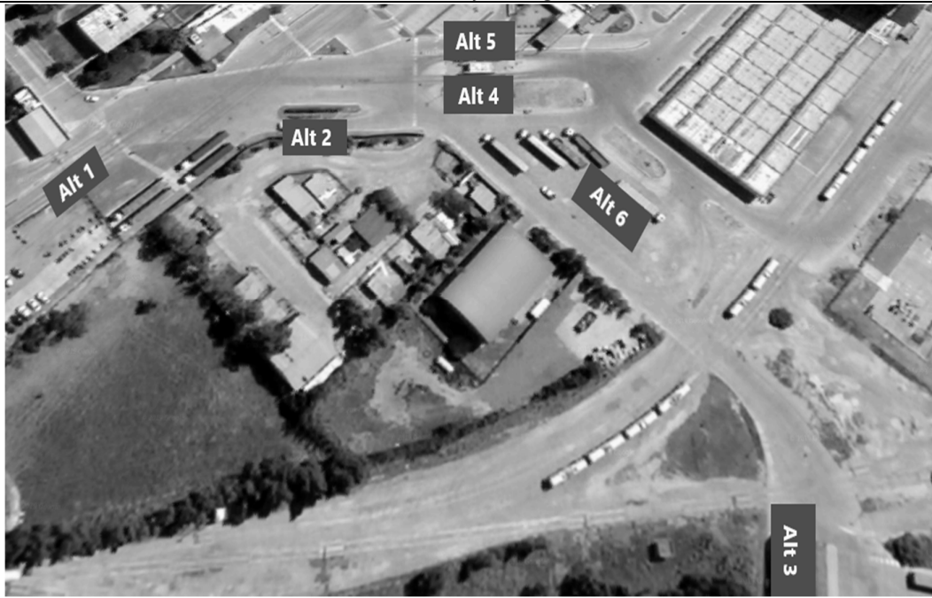
Fig. 1. All possible locations of Balance 3--