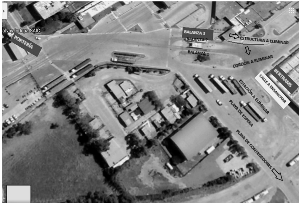
Fig. 7. Alternative 5: the new Balance 3 next to balance 2.

This potential location of balance 3 entails a slight variation of the truck circulation plan, but a significant change in the circulation of smaller vehicles (cars and vans) of both the company and individuals, as well as some building modifications. In particular, some existing building structures that limit the maximum height of circulating vehicles should be eliminated. In turn, part of the sidewalks must be removed so that trucks can access the balance 3. These modifications should always consider that truck traffic should not be linked to that of smaller vehicles, since trucks may be hazardous chemical transporters. dangerous. So, on that street only trucks could pass, and smaller vehicles must do so along the service street next to the truck beach. This division of traffic allows, in addition to complying with security issues, to order the great traffic that is generated in that sector of the company.