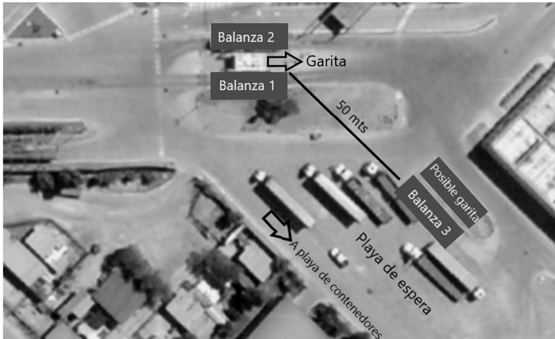
Fig. 8. Alternative 6: the new Balance 3 located in container area.

transit plan. A subsequent drawback is that the only available sector suitable for a new truck waiting parking is the container area. What would generate a complete restructuring of the internal logistics system by having to reposition the container area.