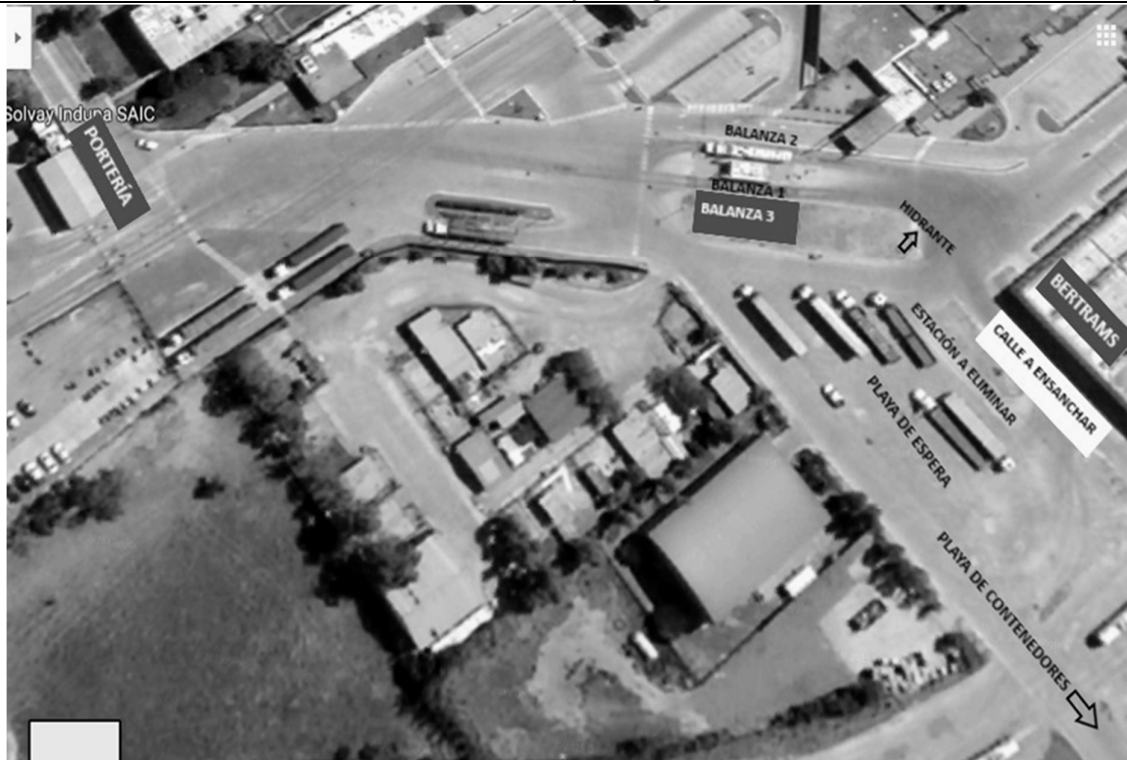
Fig. 6. Alternative 4: the new Balance 3 next to

Placing balance 3 in this place would not produce variations in the current vehicle circulation plan. The infrastructure modifications that are required for this location are very slight compared to other alternatives, mainly, eliminate some sidewalks, trees and relocate a luminaire and the hydrant (for case of fire). The width of the circulation street where salt trucks enter and exit should also be increased. This widening will allow a double-lane street where salt trucks enter through one lane and trucks leave through the other. Also, trucks that transport different finished products may wait in that new exit lane, then move on to balance 2 or 3 and leave the plant.