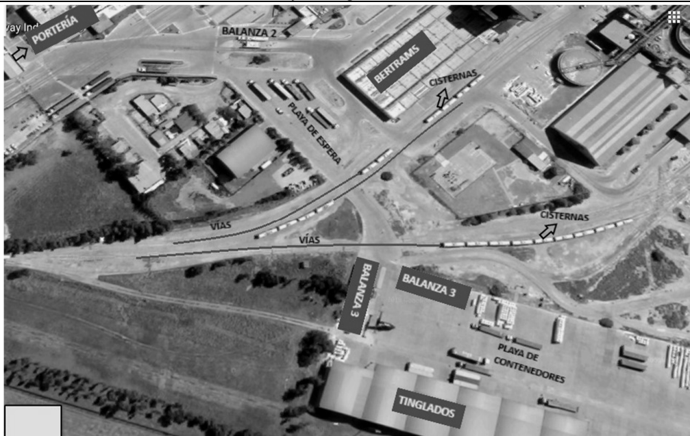
Fig. 5 . Alternative 3: the new Balance 3 at entrance of container beach.

In turn, the light that must be left on the tracks must be enough so that the tanks that carry hazardous chemicals circulate, and thus, avoid any type of accident. In addition, by placing balance 3 in this position, it will practically limit its use exclusively for container trucks (for export) and trucks that load product available only in the sheds from 1 to 6. For trucks that load in silos (sector where it is loaded in bulk), production shed, sheds from 7 to 15 and transfer area would not be viable since the route of the trucks increases excessively. All this increases