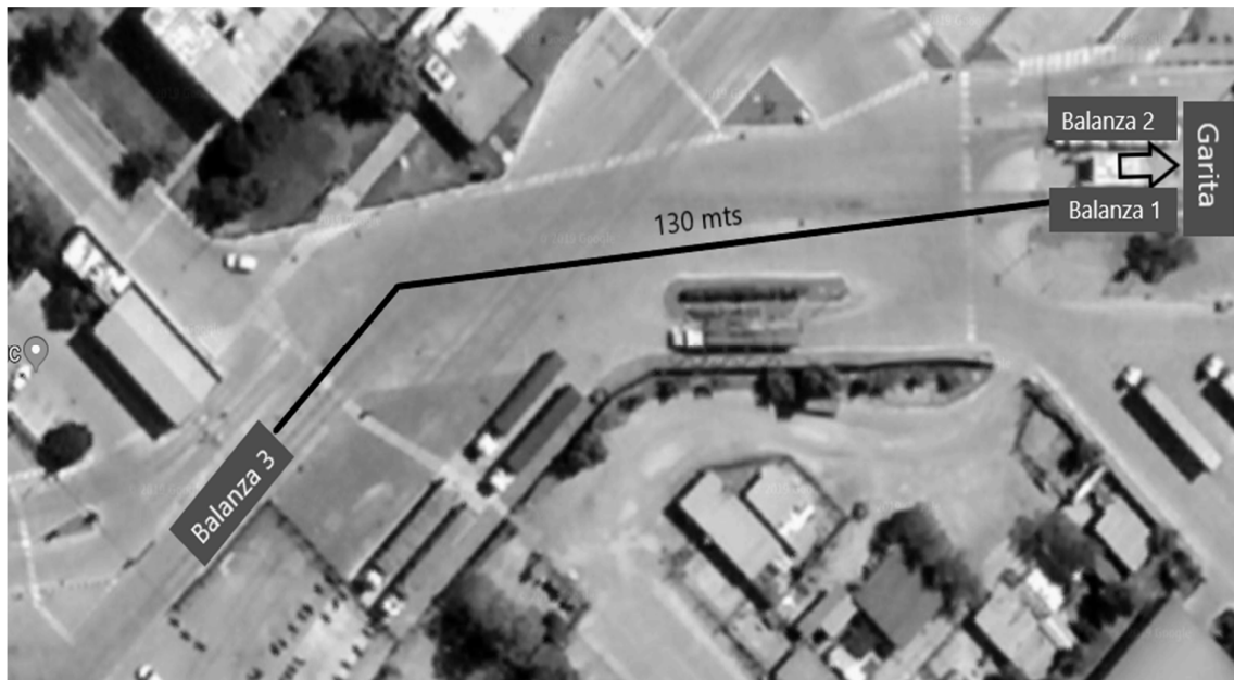
Fig. 2. Balance 3 located at the entrance checkpoint

would not be affected. The balance 3 can only weigh trucks entering the premises, whether full or empty. An important aspect to analyze is the distance between the goal and the balancing office: 130 meters, which the driver must walk walking to show the relevant documentation. This long journey implies considerable time, which would have an impact on the operation not only the operation of the new balance but also the other two, by inhibiting the entry of new trucks.