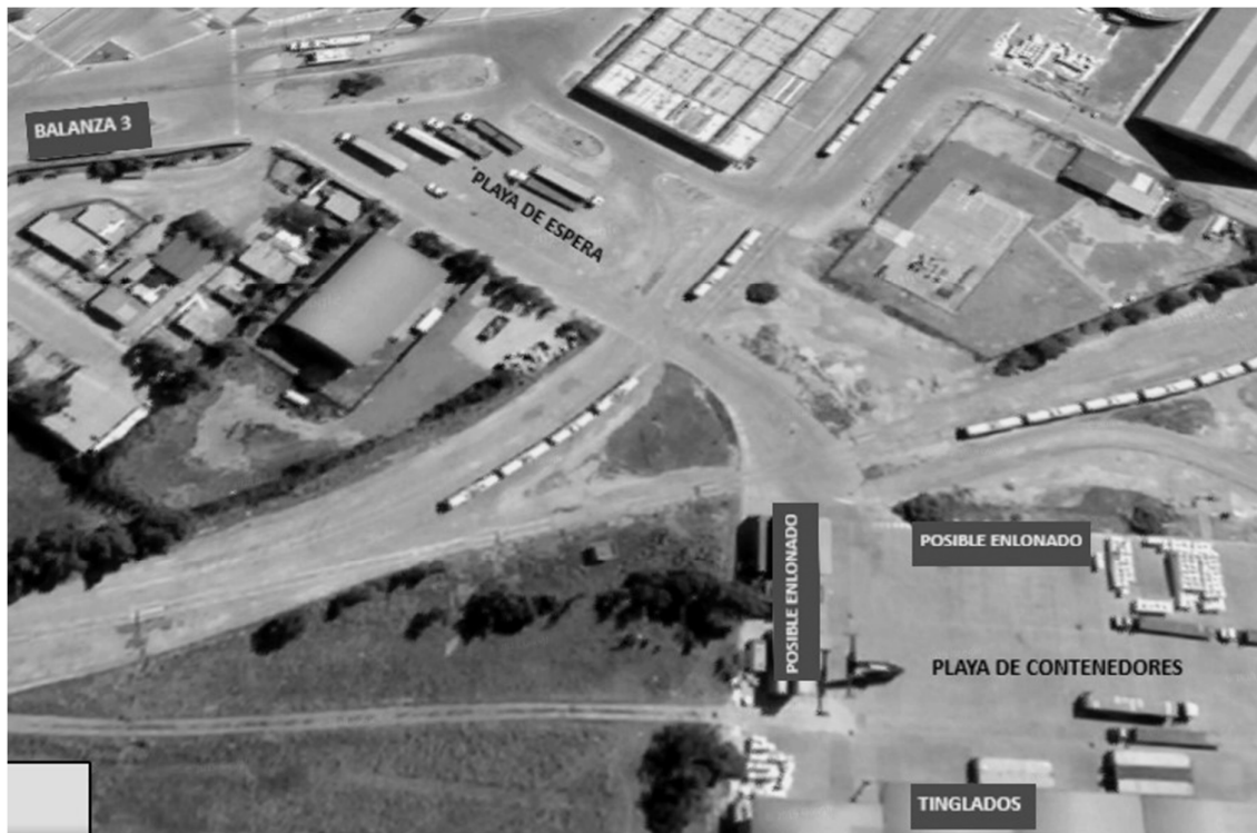
Fig. 4. Possible places for truck covering place.

Option 3. A third option for the covering structure would be in the area of the container area. However, a very important point of this option is that the space to manoeuvre the trucks will be very limited, since the container requires a lot of space due to safety restrictions.