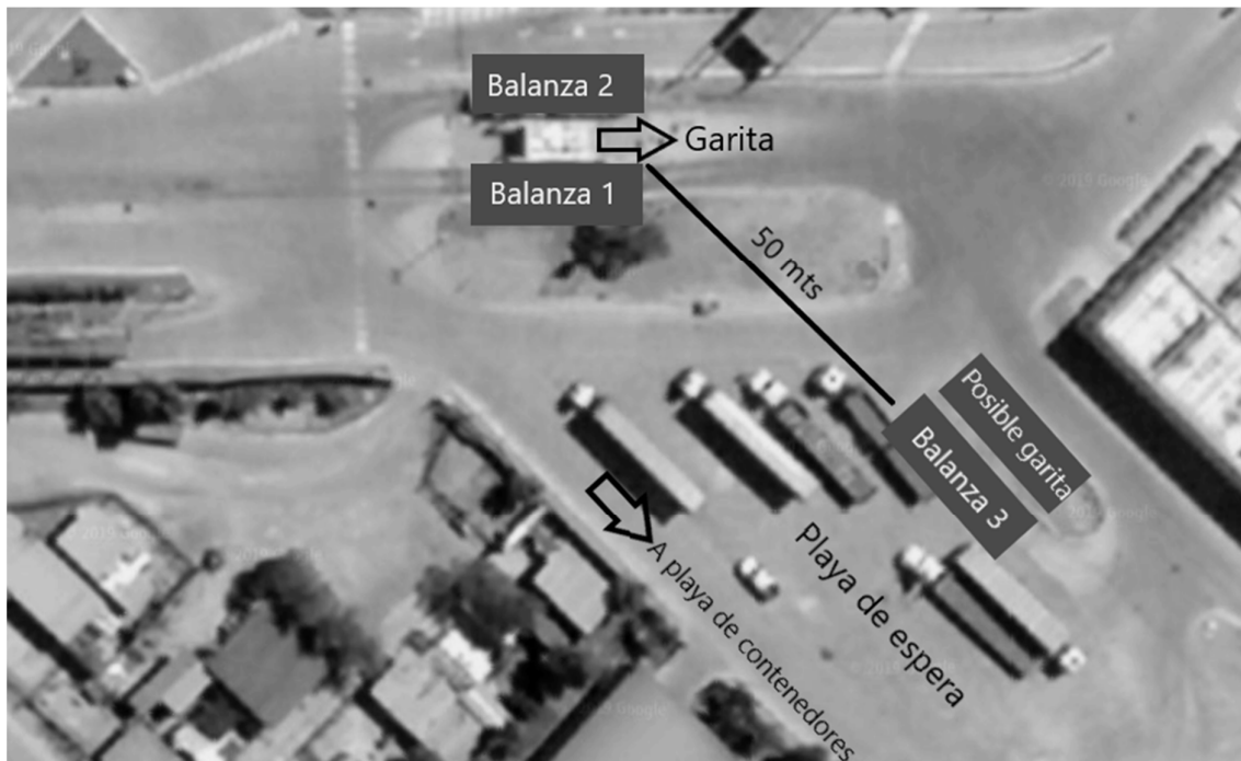
Fig. 8. Alternative 6: the new Balance 3 located in container area.

transit plan. A subsequent drawback is that the only available sector suitable for a new truck waiting parking is the container area. What would generate a complete restructuring of the internal logistics system by having to reposition the container area.