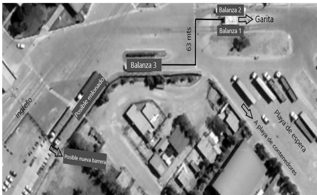
Fig. 3. Alternative 2: the new Balance 3 located at truck covering place

However, this location of balance 3 implies a change in the infrastructure and in the design of internal transit of the company facilities. Since the place where the trucks are covered must be relocated, involving the construction of the covering structures again, as well as facilitating access and exits to the new location.