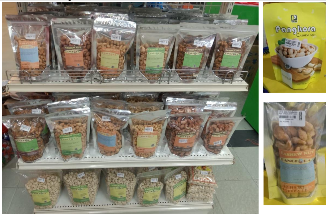
Fig. 1. Products by MSME CV hukasari semesta in muna