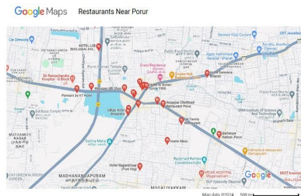
Fig. 1. Restaurants around porur

densely populated residential area, boasting a plethora of thriving restaurants in its vicinity. Figure 1 is a representation of the Google map showcasing the restaurants in Porur. The ability to provide online food delivery services is imperative for the sustenance of most restaurants. However, the primary challenge faced in the realm of online business pertains to logistics. It is essential to analyze delivery zones to accurately determine delivery distances thoroughly. Ensuring timely delivery and maintaining food quality standards are pivotal for the success of restaurants. Business proprietors often grapple with issues related to vehicle allocation and delivery services. Timely delivery emerges as a pivotal factor influencing customer retention rates. Hence, establishing a successful food delivery business necessitates implementing an effective strategy in vehicle allocation. In our study, the choice of delivery vehicle remains flexible, tailored to specific criteria such as distance, congestion, and order size. While bikes excel in dense urban areas for short distances, scooters and motorcycles offer greater speed and coverage. Cars are preferred for longer distances or larger orders, often utilized by major delivery services like Uber Eats. Vans are utilized for bulk deliveries or when transporting substantial quantities of food. Thus, the selection of vehicle is contingent upon various factors to ensure efficient and effective food delivery.