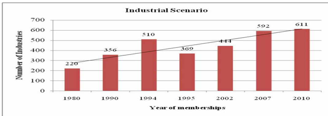
Fig. 1. Industrial Spectrum at Vitthal Udyognagar Industrial estate

Rotated Matrix: There are various methods of rotations. The method of rotation used is varimax, which is the most commonly used rotation method in factor analysis. The variance explained by each component after the varimax rotation method and the number of factors extracted based on Eigen value 1 and more, total variance explained is 64.0130%, the variables associated with four factors are grouped (see appendices, table 6).