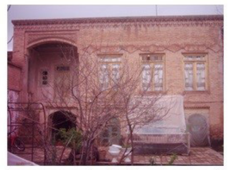
Image 8 . Cheshmi house of Sabzevar, fourth period of Qajar (reference: authors, 2014)

ples by relevant agencies. By being present in historical areas and interviewing old residents of the historical areas, a number of houses were made known to us. Also we used some document library sources. In various stages of doing the research, we used descriptive, historical, survey and simulative methods.