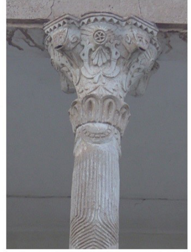
Image 3 . Roman column heads in the second period of Qajar, Sabzevar (reference: authors, 2014)