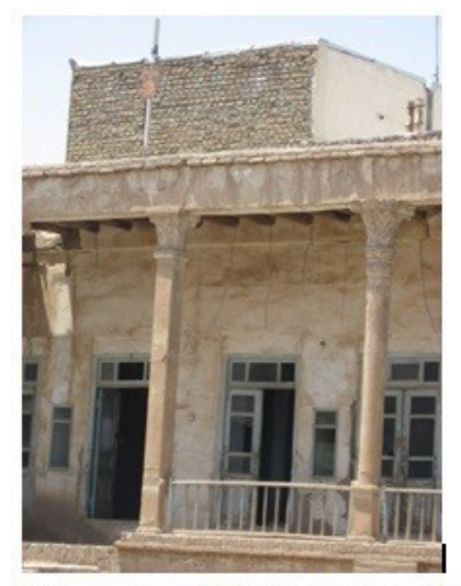
Image 7 . Aldaghi house of Sabzevar, fourth period of Qajar (reference: authors, 2014)