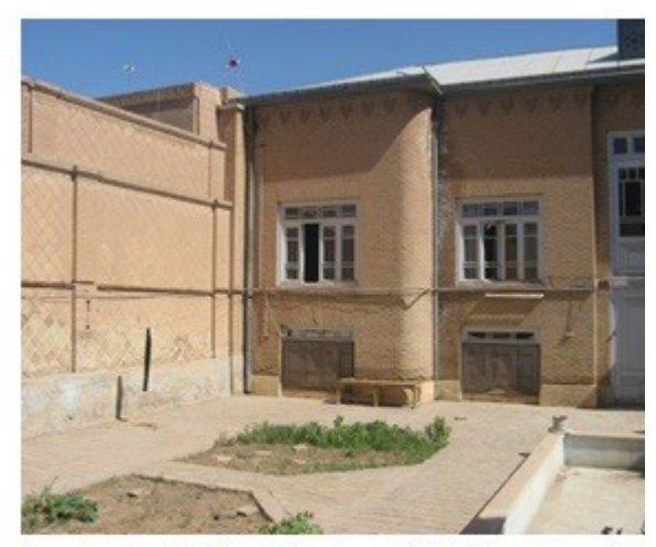
Image 5 . Eslami house of Sabzevar, thi period of Qajar (reference: authors, 2014)

6.4. Fourth type – late Qajar and Early Pahlavi: in this period, we see many but simple decoration and symmetry in plan (image 6). The houses are extrovert and the elements entrance, vestibule and hall are hardly ever found in a house. Case samples of this period are the Aldaghi houses, Shariatmadar, Baghani, Cheshmi and Sadidii (Kermani Moghaddam 2003, 6) (images no. 6, 7, 8)