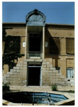
Image 1 . Moslem house of Sabzevar, first period of Qajar

6.1. First type – late Safavieh, early Qajar: in this period we see houses which are simple in terms of decoration and the houses are very introvert. A case sample of this period is the Mosel house of Sabzevar (Tohidi Manesh 2002, 5) (image 1).