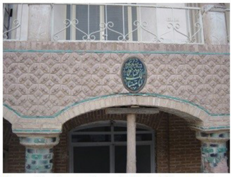
Image 2 . decorations in Hejazi house of Sabzevar (reference: authors, 2014)

6.2. Second type – early to middle of Qajar period: in this period, they paid attention to decorations more carefully (image 2) and we often observe Roman decorations in the columns (image 3). Houses were introvert and a case sample of this period is the Hejazi house of Sabzevar (Kermani Moghaddam 2002, 3), (image 4).