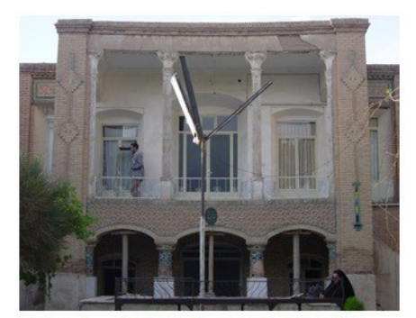
Image 4 . Hejazi house of Sabzevar, second period of Qajar (reference: authors, 2014)

6.3. Third type – mid-late Qjar: in this period, decorations of columns are reduced and decorations of the rooms are also simple but the porches have plaster decorations in the ceiling. Among the case samples of this period are the Eslami houses, Heshmat Nia and Karimi (Tohidi Manesh 2001, 7), (image 5).